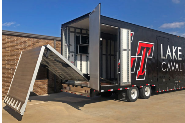
The synchronization feature of the Electrak HD helps coordinate smooth, safe and quick ramp operation.

With millions of dollars of marching band equipment to transport up to 20 times per year, the team at Clubhouse Trailer Company was challenged with maintaining the safety of the equipment as well as those loading and unloading it. A key contributor to their success was making the switch from hydraulic cylinders to Thomson Electrak® HD electric linear actuators.